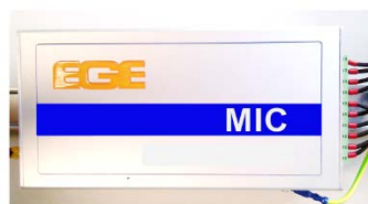
Fig.4 Equipment for automatic measurement of the capacitive earth-fault current in a network with isolated neutral

This article has been written based on own knowledge and long-time experience acquired during the processing of measurements in the distribution network. These measurements and the conclusions resulting from them are included in the measurement reports and are not publicly available. The described method has been verified in real operation and based on the results, a special-purpose automatic system for the measurement of the capacitive earth-fault current in a network with isolated neutral point has been developed Figure 4.